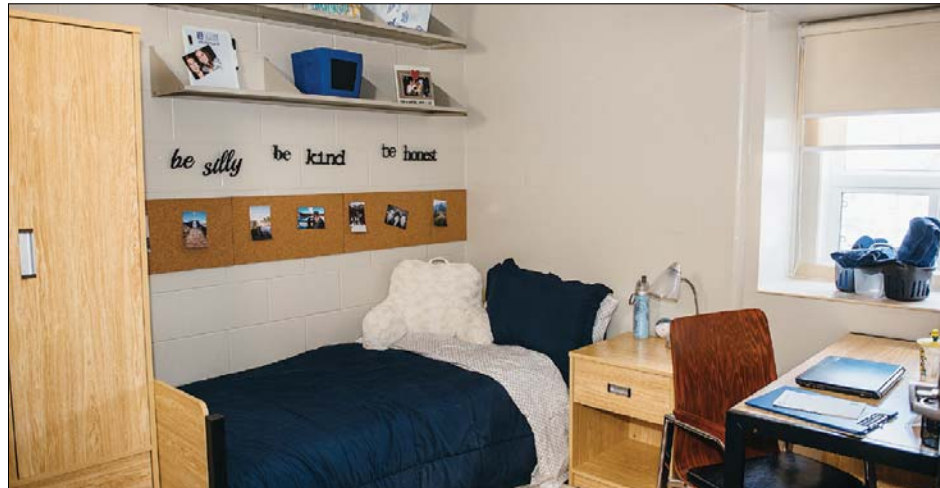
A private dorm room at the Luther Residence.

Students living in the Luther Residence can choose from one of three meal plan options, with current plans ranging