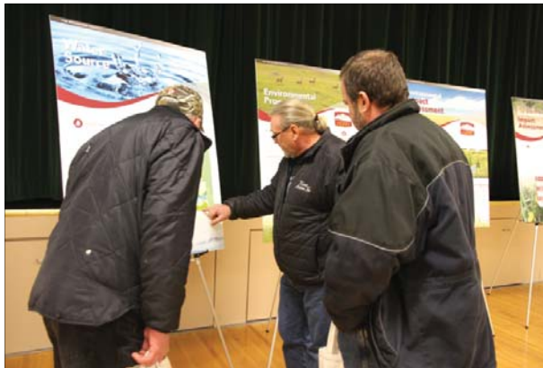
Below: The Canada Golden Fortune Potash Corporation open house at Broadview in January.