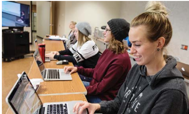
Parkland College students in class.

And to help you along the way, the College's scholarship program awards over $100,000 each academic year. Students taking a full-time post-secondary program at Parkland College in the fall of 2018 may apply for Entrance Scholarships from March to May. More information will be made available at scholarships.parklandcollege.sk.ca . Visit parklandcollege.sk.ca , call toll-free 1-866-783-6766, or follow @CollegeofChoice on Facebook, Twitter, and Instagram.