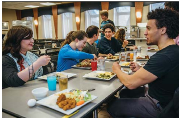
Students having lunch at the Luther College Cafeteria.