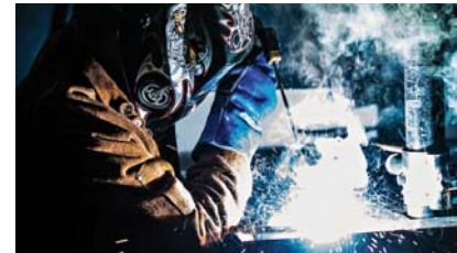
A student welding at Parkland College.