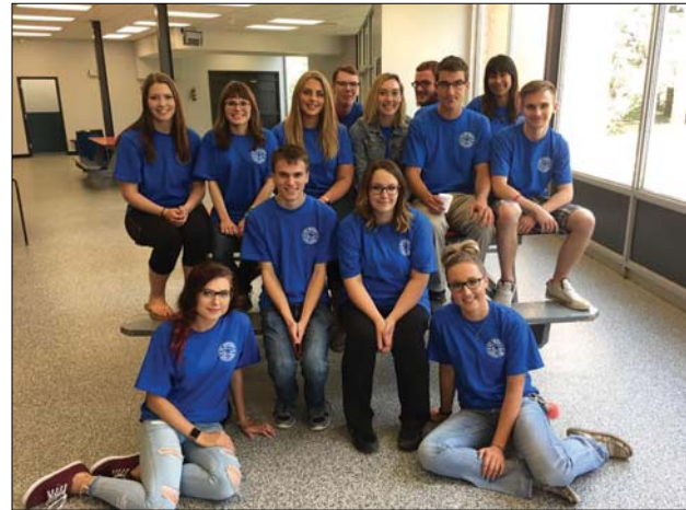
Students of St. Peter's College