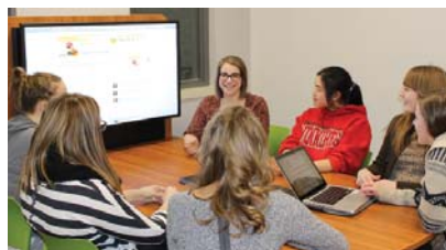
Students in a small class setting.

For more information please contact one of our STM student advisors at 306-966-8900.