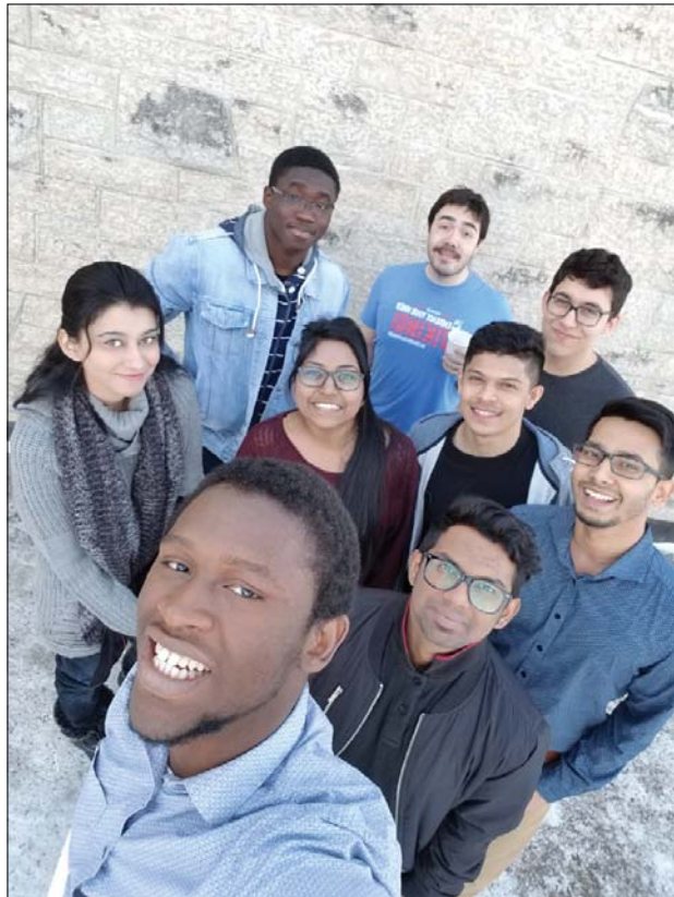
Students of St. John's College