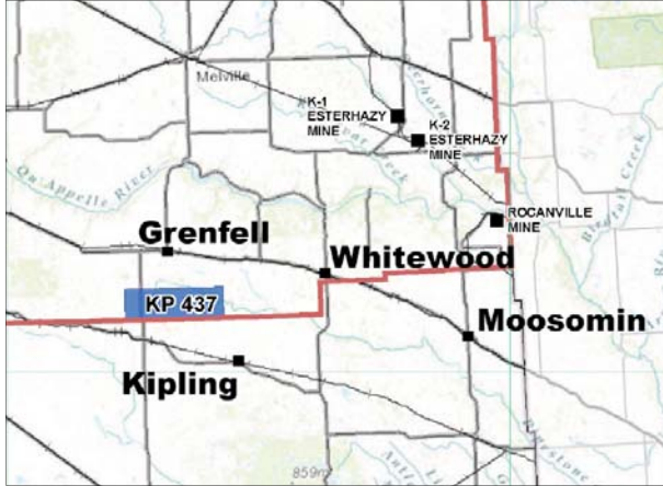
Above: The area marked in blue on the map is the area within which the company would be allowed to mine potash.

"There are so many interesting projects coming forward now, I think 2018 is going to be a very good year for Saskatchewan. We have a lot of value-added projects in the ag sector coming on, in processing fractionation, fibre—there is a lot of interest in the ag sector, as well as in the mining sector."