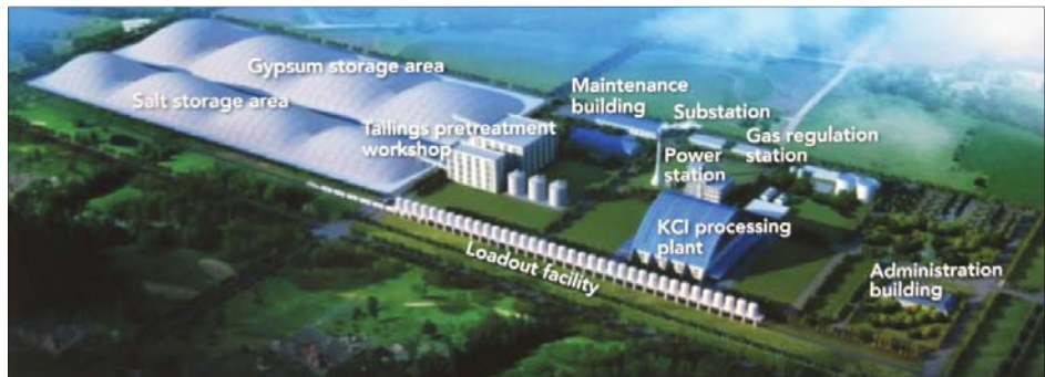
A graphic rendering showing what the solution mine would look like.

"2,500 jobs during construction? Our economy could take that," he said. "A couple of hundred jobs permanently would be great for the whole region, and