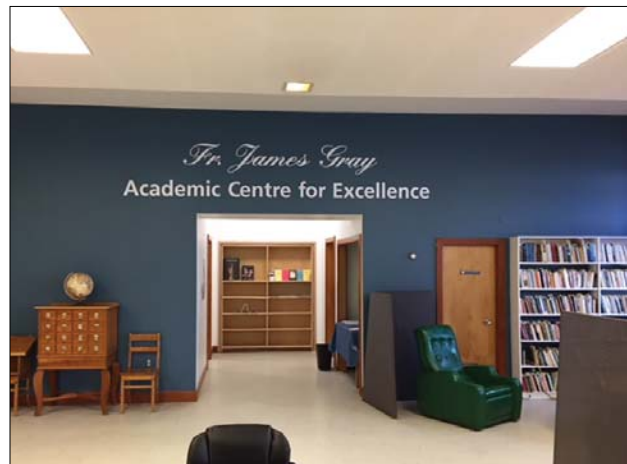
St. Peter's renovated Academic Centre of Excellence.

St. Peter's College, Muenster, SK • 306.682.7886 • www.stpeterscollege.ca