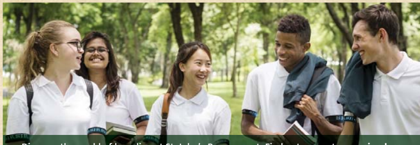
Discover the world of boarding at St. John's-Ravenscourt. Find out more at www.sjr.mb.ca .

As an SJR boarder, students have the unique opportunity of developing life skills that will help them navigate today's world. Daily and weekly routines help develop a positive work ethic along with a sense of discipline, pride, and self worth. This lifestyle encourages boarders to become mature, independent decision-makers, which helps them hone their own personal leadership qualities. SJR's boarding program complements its overall academic and athletic programs which, when taken together, offer a rewarding experience, and encourages interpersonal harmony, respect, empathy, independence, and lifelong learning.