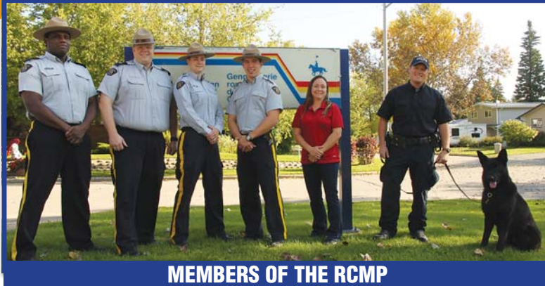
MEMBERS OF THE RCMP