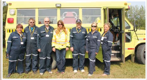
WELWYN FIRST RESPONDERS