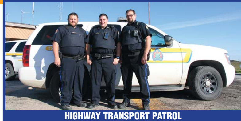
HIGHWAY TRANSPORT PATROL