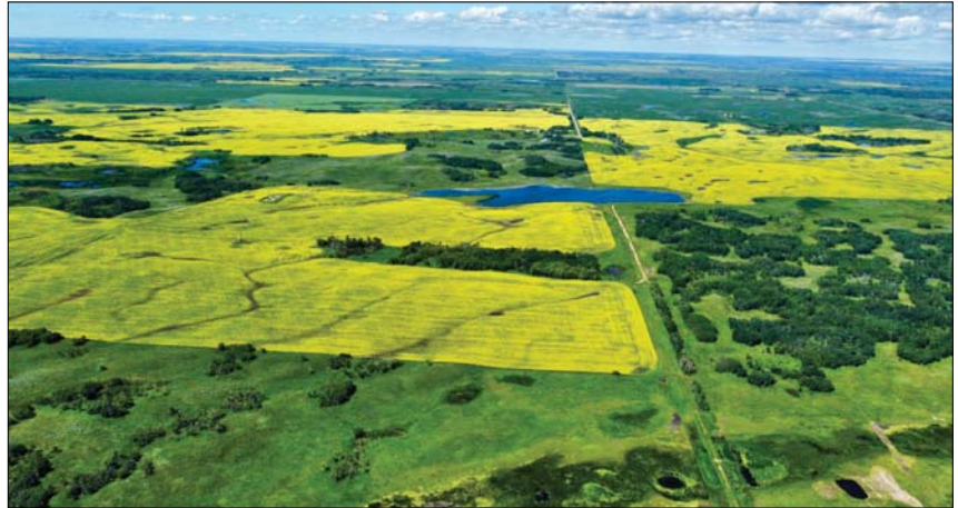
An aerial photo of the crops between Moosomin and Fairlight, Sask last week.

By sharing economic knowledge and forecasts, FCC provides solid insights and expertise to help those in the business of agriculture and food achieve their goals. For the most recent economic insights and analysis on farm cash receipts, interest rates and inflation, visit FCC Economics at fcc.ca/Economics .