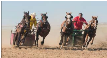
Some scenes from a previous Elkhorn Western Weekend, including chariot races, above.