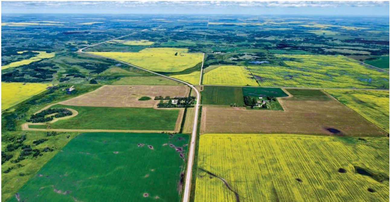
An aerial photo of the crops between Moosomin and Fairlight, Sask last week.