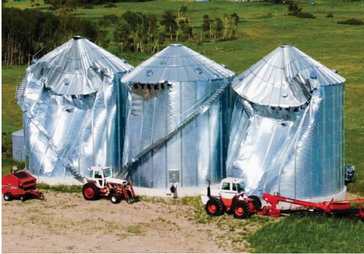
Wind storm damage A wind storm July 15 caused extensive damage across the area, affecting many farms and agriculture businesses. Above and below, damage to grain bins and a farm storage building north of Moosomin. At right, damage to the Viterra terminal at Grenfell. Below right, debris from the Paterson elevator at Grenfell thrown across the street.