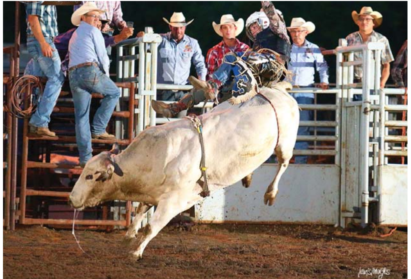
A scene from last year's Moosomin Rodeo

The kickoff barbecue and the pancake breakfast have long been a part of the rodeo weekend.