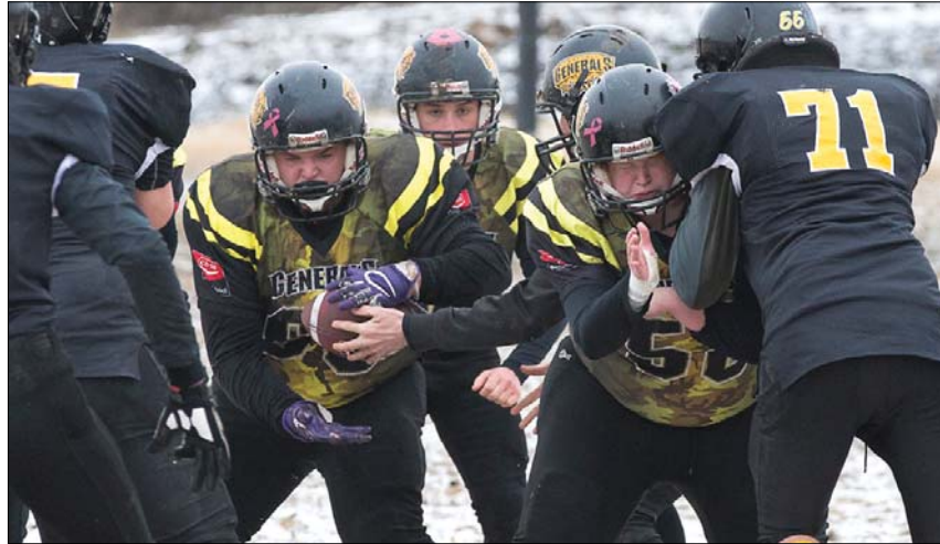
The Moosomin Generals in action during a fall season RMFL game.

How do the Generals manage risk? Player safety is always the number one factor. We train our coaches and expect that Football Canada's Safe Contact program techniques are taught and executed at all age levels. Age appropriate, active risk mitigation is also a priority. In our younger