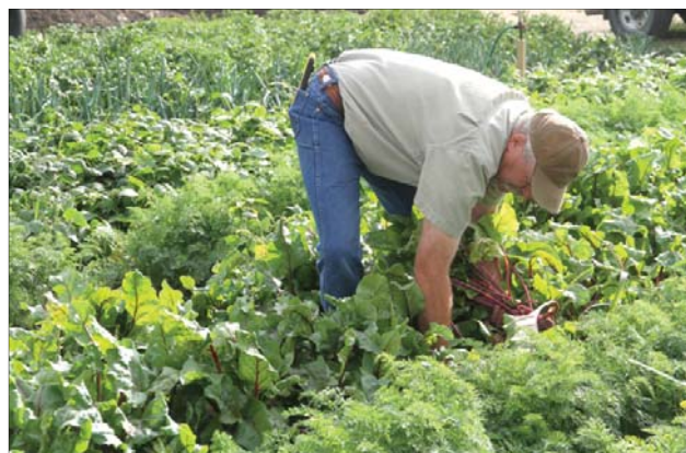
Harvesting vegetables in last year's community garden.