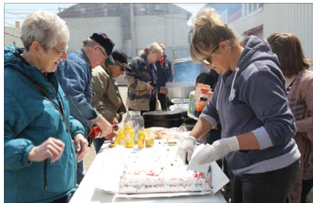
The first anniversary barbecue for the new location on May 10.