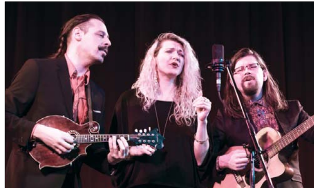
Red Moon Road, above, and Ghost Boy, left, performing as part of the 2018-19 MADAC show lineup.