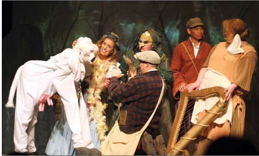
A scene from "Into the Woods" which was the last Creative Vision Productions musical performed in 2017.