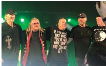
Above: Party band Trooper performing at the hall at Christmas.