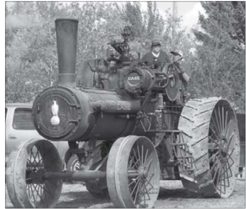
Above: The Museum's working steam engine.