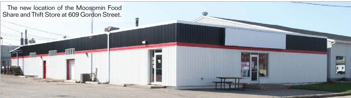
The new location of the Moosomin Food Share and Thrift Store at 609 Gordon Street.