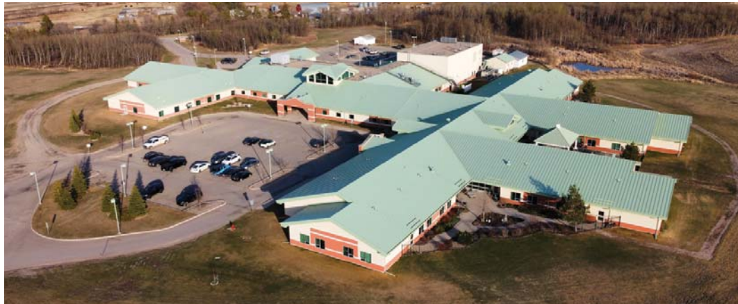
The South East Integrated Care Centre provides a wide range of health care services for Southeast Saskatchewan.