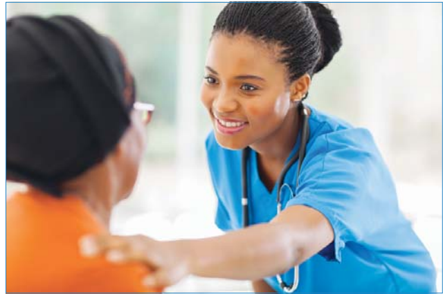
Nurses represent a trusted voice on health-related issues in Canada.

This National Nurses Week, join the country in thanking these caregivers (all 3.6 million of them) for the role they play in meeting the health-care needs of Canadians in hospitals, nursing homes, community health centers, schools and even correctional facilities.