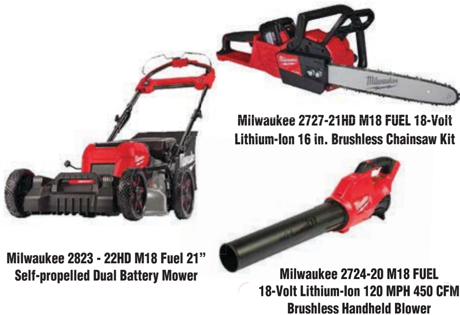
Milwaukee 2823 - 22HD M18 Fuel 21" Self-propelled Dual Battery Mower