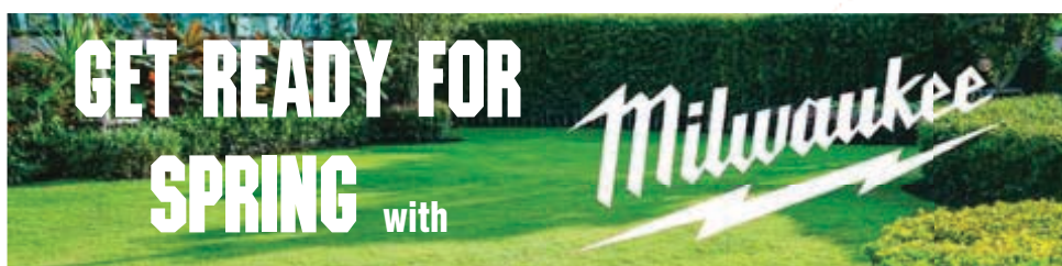
Milwaukee 2724-20 M18 FUEL 18-Volt Lithium-Ion 120 MPH 450 CFM Brushless Handheld Blower