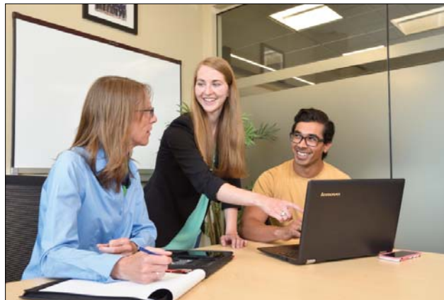
Below: Paul J. Hill School of Business faculty member and students.

pairs students with members of the business community in their industry of interest.