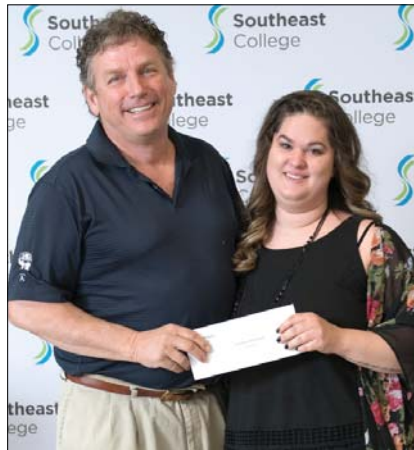
Southeast College awards a first-year university student the prestigious Al Yeaman Studentship Award.