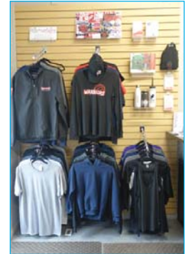
Right: Some of Positive Signs' merchandise on display.