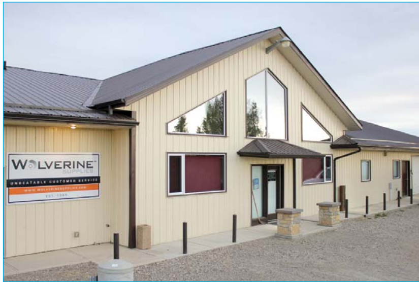
The storefront of Wolverine Supplies.

Wolverine Supplies also has a strong sense of community and is proud to have a long history of supporting our community and our industry by sponsoring local and national events, youth groups, gun clubs and non-profit organizations. Some of our more recent sponsorships include STARS® Air Ambulance, Canadian Mental Health Association, Courageous Companions, Ronald McDonald House, Westman Special Olympics and the Virden Indoor Rodeo.