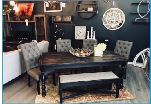
One of CF Sunrise's clients, Zaylie Furniture & Appliances.

start a money-making side to their operations, and small businesses that need a boost to their pre-Christmas inventory should contact CF Sunrise for assistance.