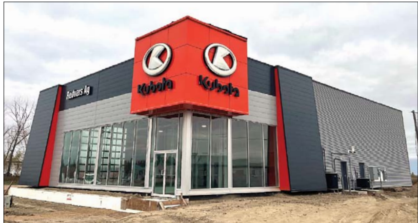
The new Redvers Ag dealership at the junction of Highways 8 and 13 in Redvers.